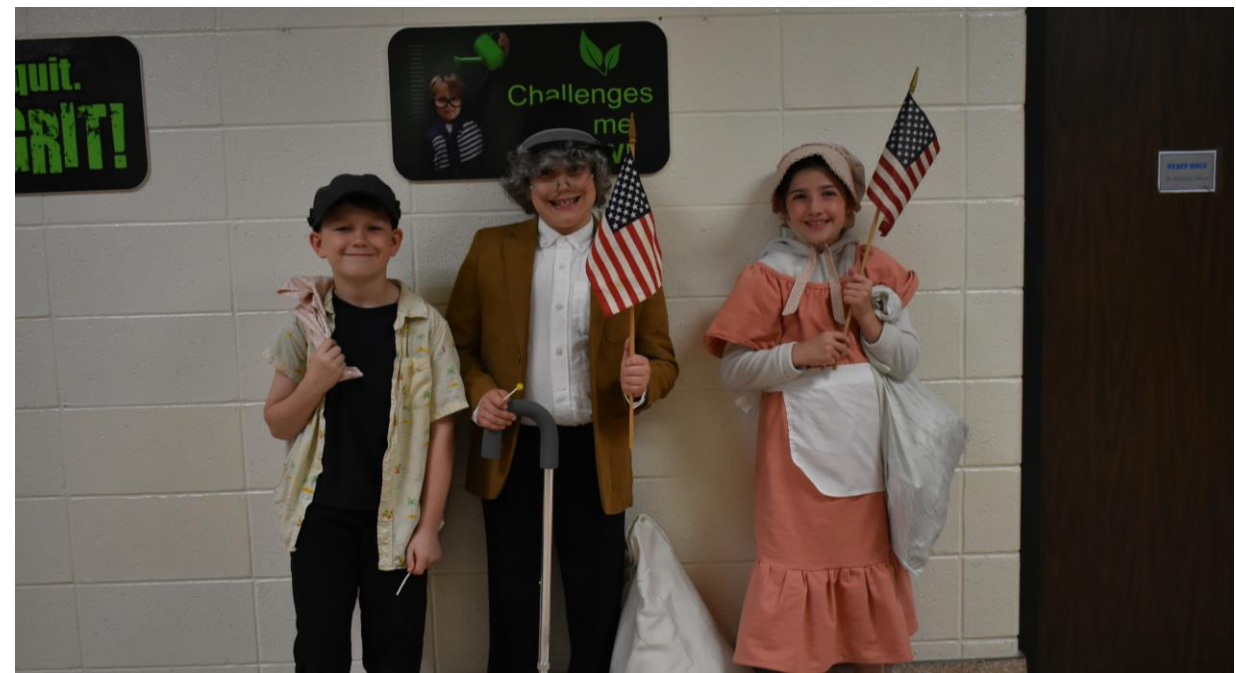
Huntertown Elementary – learning about immigration to the United States. The frowns are because it was scary coming to a new country.